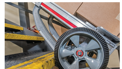
Stair climbers assist with transporting loads up and down stairs