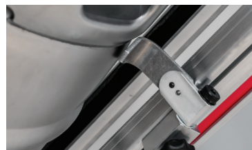
Optional keg stabilizers eliminate the need for straps when transporting one or two kegs