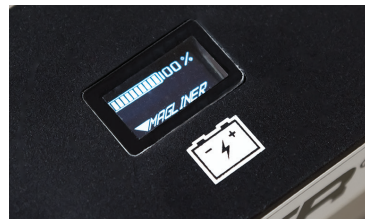
Battery level indicator