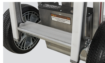
Integrated kick bar assists with breaking back loads