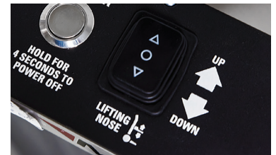
Simple, variable-speed lifting and lowering operation