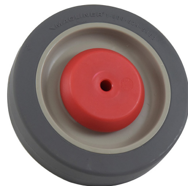
131020W Caster Wheel