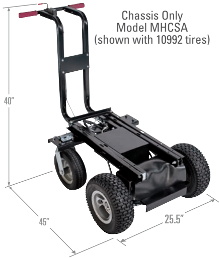
Chassis Only Model MHCSA (shown with 10992 tires)