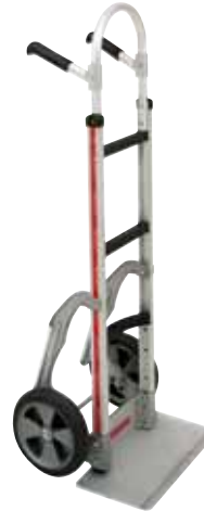
630-G1-1030 C5 (Shown with recessed nose.)