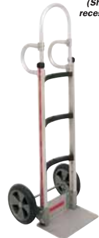
535B-E1-1030 (Shown with recessed nose.)